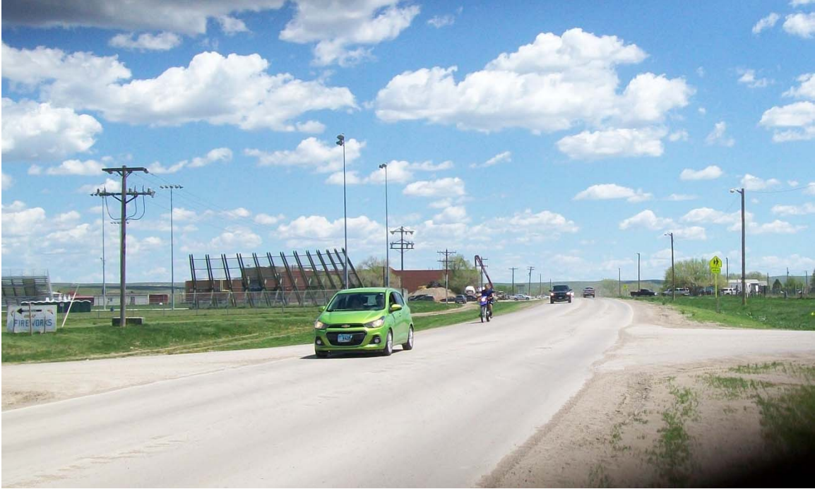
BIA 2 – looking east at Little Wound School (left side) from the gas station entrance.