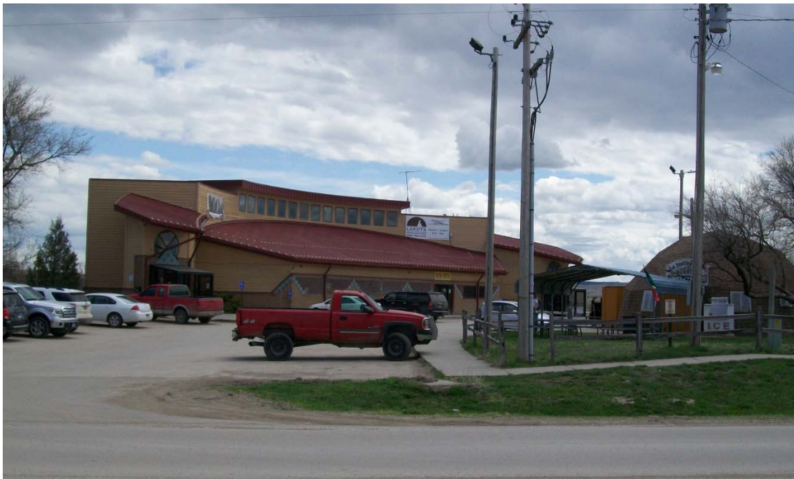
The Lakota Trade Center is located near the east edge of Kyle along BIA 2. It contains several businesses and the local bank.