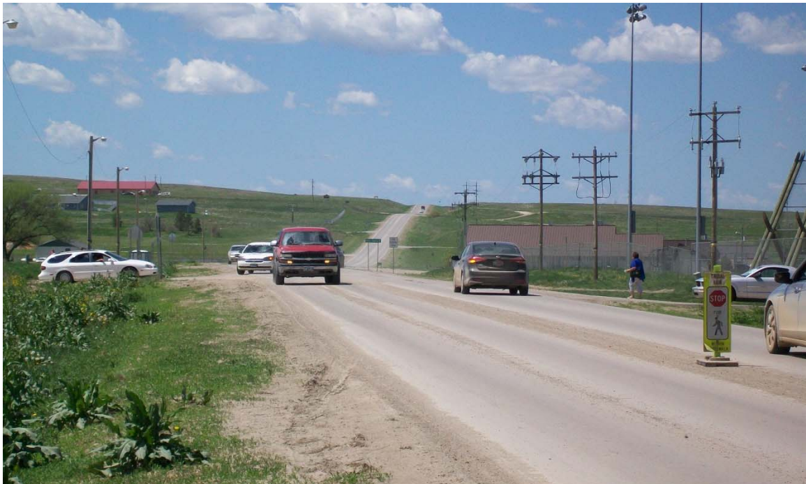
BIA 2 – looking west from BIA 4 at busy post office street intersection (on left). To accommodate the heavy traffic, the Project will improve BIA 2 with curb and gutter, 12-ft lanes and a center turn lane.