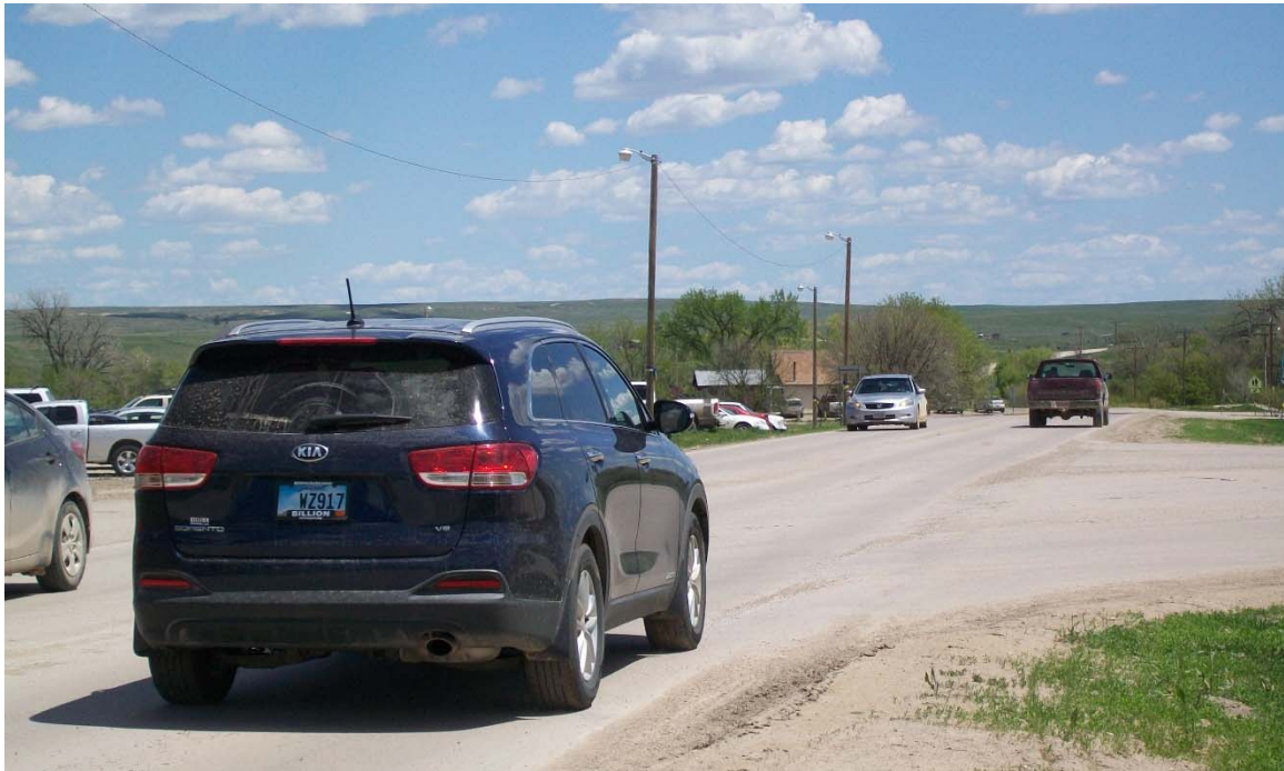
BIA 2 – looking east at BIA 4 T-intersection (on right)