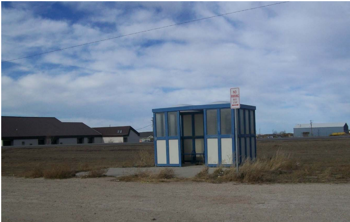
An existing a transit bus stop is located along BIA 2 at the gas station and across from Oglala Lakota College. The Kyle Pathway project is planned to connect to the transit bus stop.