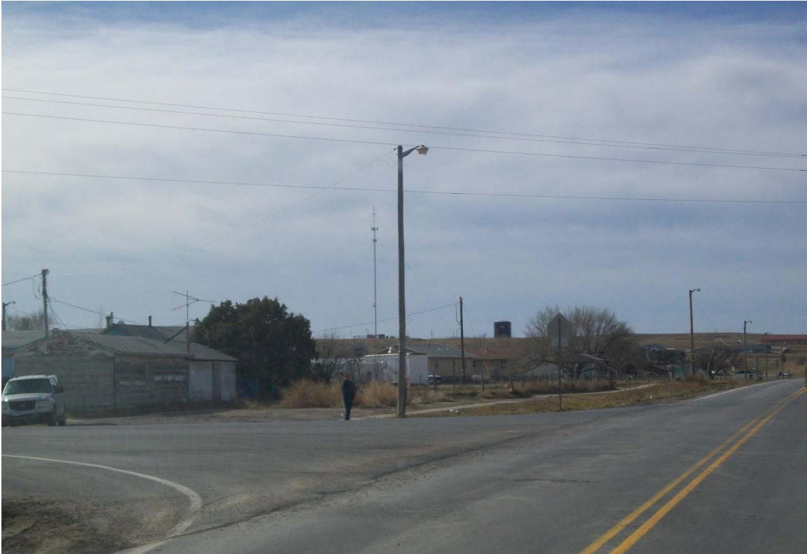
Housing developments exist on both sides of BIA 2, generating significant pedestrian traffic crossing BIA 2 without adequate crosswalk enhancements.