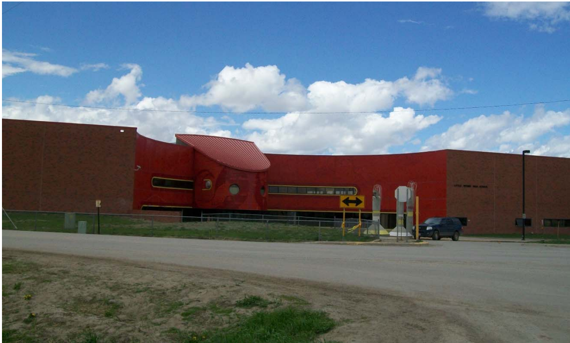
Little Wound School is a K-12 school that serves the Pine Ridge Indian Reservation. Little Wound School busses travel on the Project route east of Kyle, SD daily.