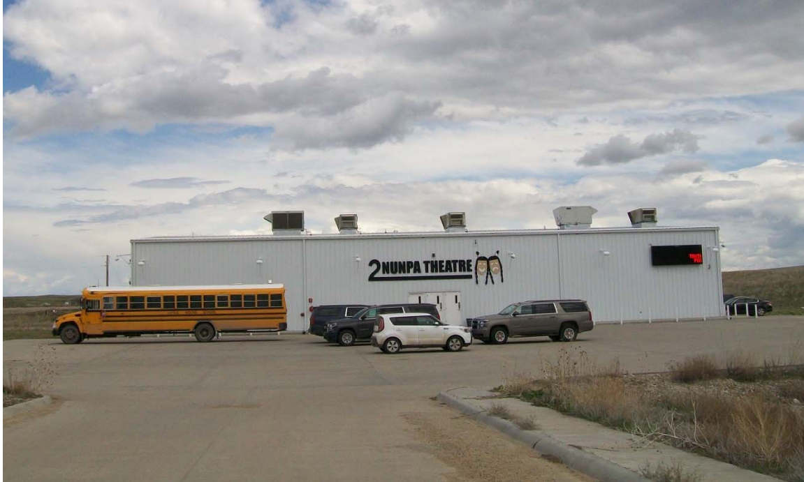
The movie theatre is located south of BIA 2 off of BIA 4.