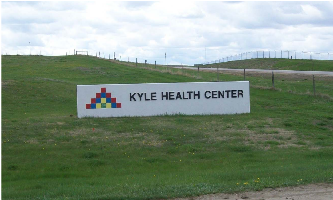
Kyle Health Center is located near the west end of the Project along BIA 2.