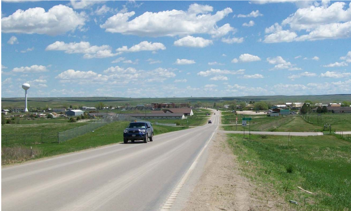
BIA 2 – looking east at Kyle, SD – Approximate project start

Kyle, South Dakota is centrally located on the Pine Ridge Indian Reservation. It is a fast growing community providing commercial development, education opportunities, health care, and goods services to Tribal members. BIA 2 is the east/west arterial bisecting the community.