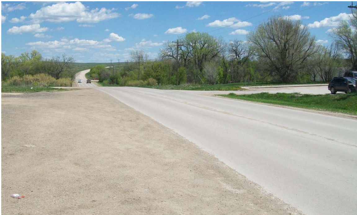
BIA 2 – looking east at Lakota Trade Center driveway (on right), and Kyle Grocery (further east on right), and approximate location for the Project’s proposed transition from urban section to rural section.