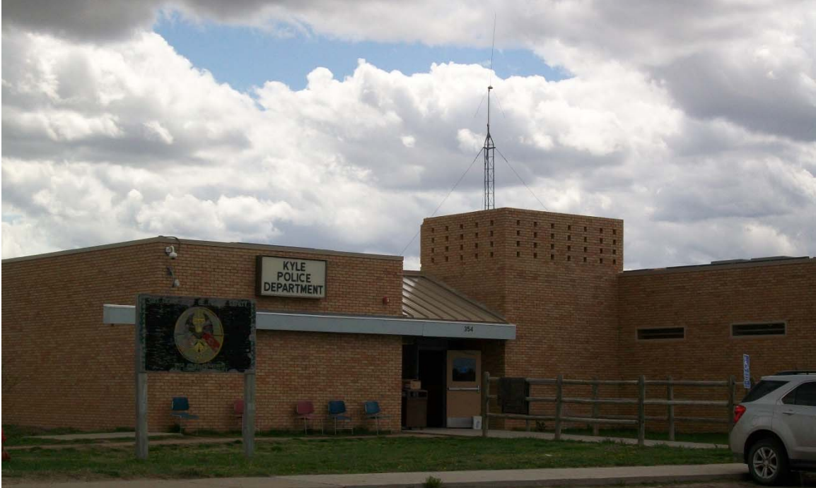
The Kyle Police Department is located south of BIA 2, with BIA 2 as the main route in and out of Kyle.