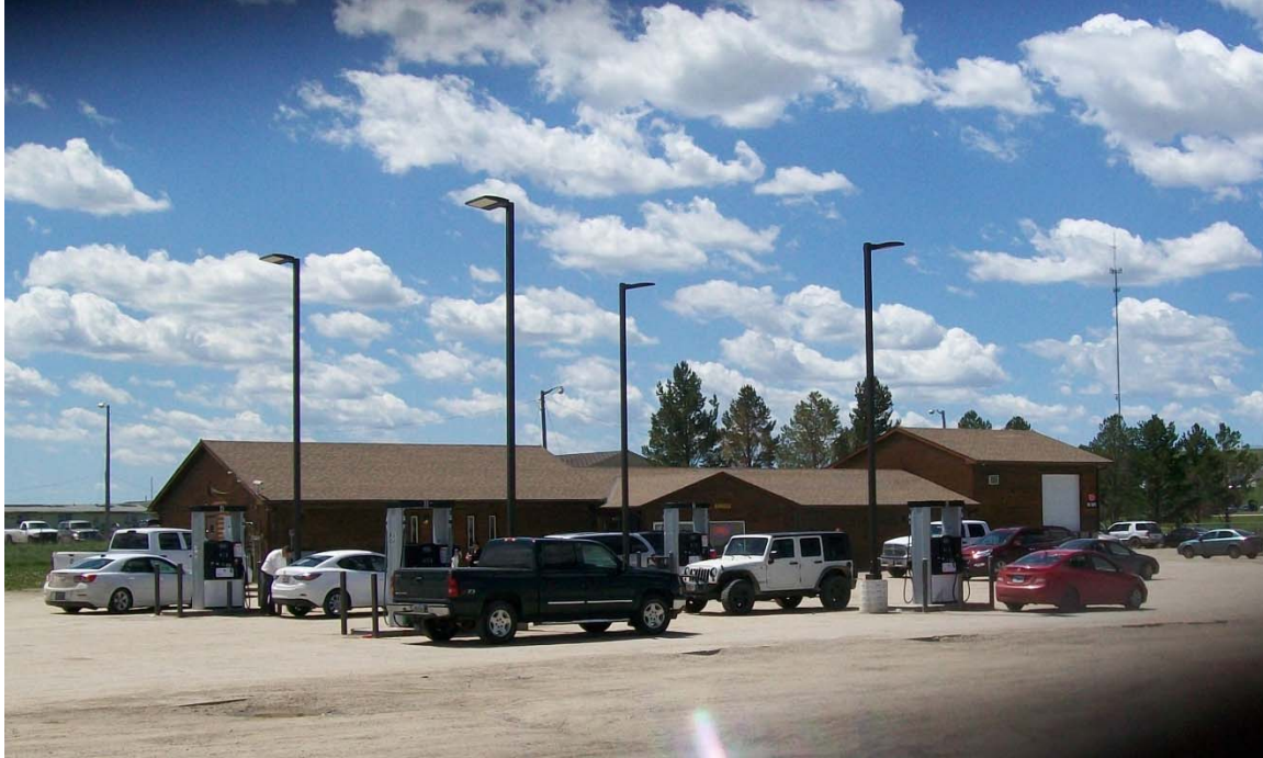
Located along BIA 2 in the center of Kyle is the gas station and convenience store. High volumes of traffic enter and exit BIA 2 at the gas station's two entrances.