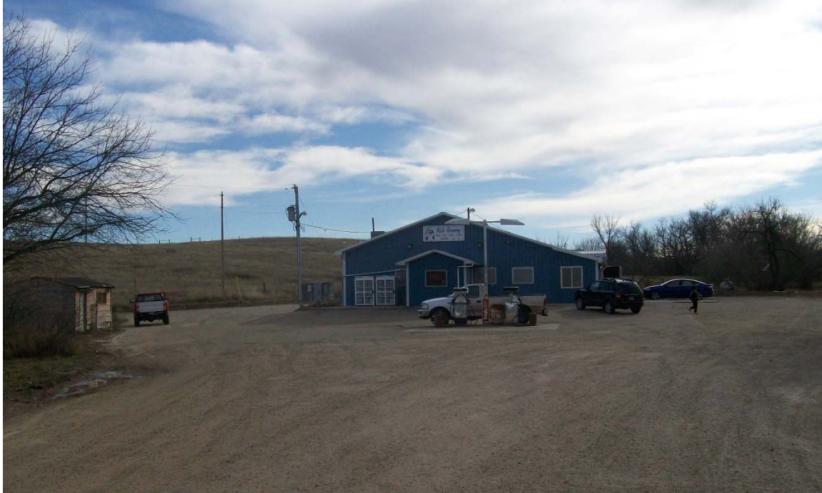
Kyle Grocery is the only grocery store in the region. The store is located along BIA 2 at the east edge of Kyle.