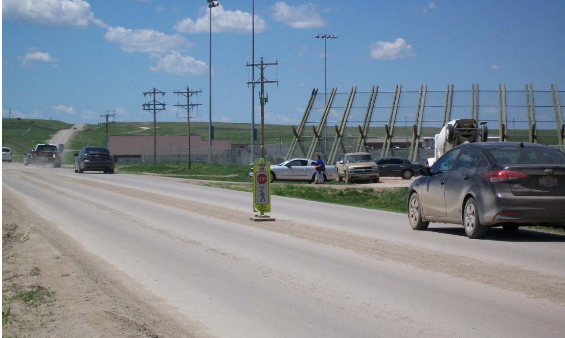
BIA 2 – looking west from BIA 4 intersection at existing inadequate pedestrian crossing for students walking to Little Wound School