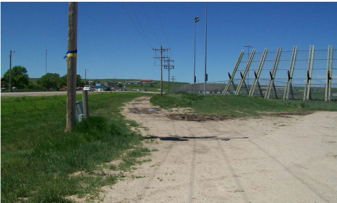
Existing beaten path on the north side of BIA 2 that Little Wound School students use to walk to Oglala Lakota College for college level classes.