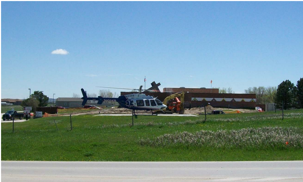
Kyle Health Center provides airlift services connecting to Pine Ridge Hospital.