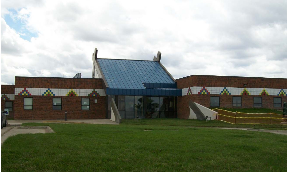
Kyle Health Center is second only to the Pine Ridge Hospital for health care on the Pine Ridge Indian Reservation.