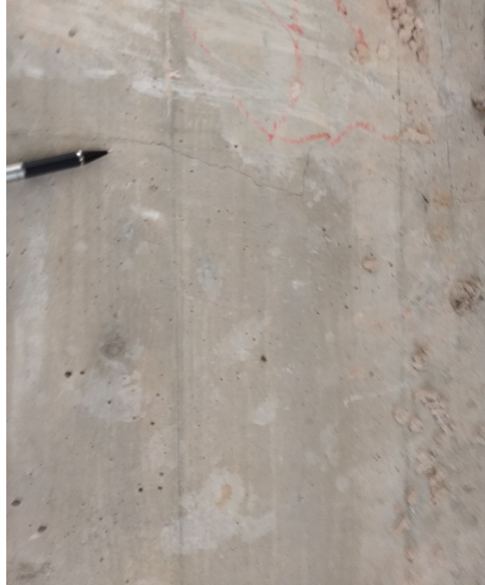
Pier cap cracking