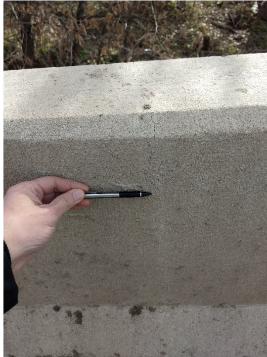
Surface finish peeling on bridge rail