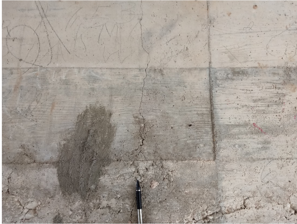
Cracking on S abutment