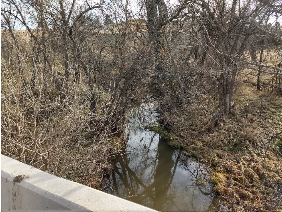
View North Through Bridge Looking Downstream