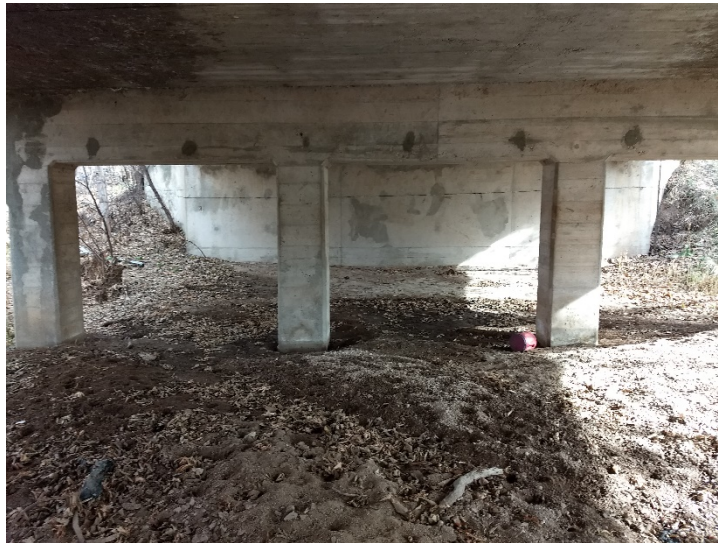
Typical pier column condition