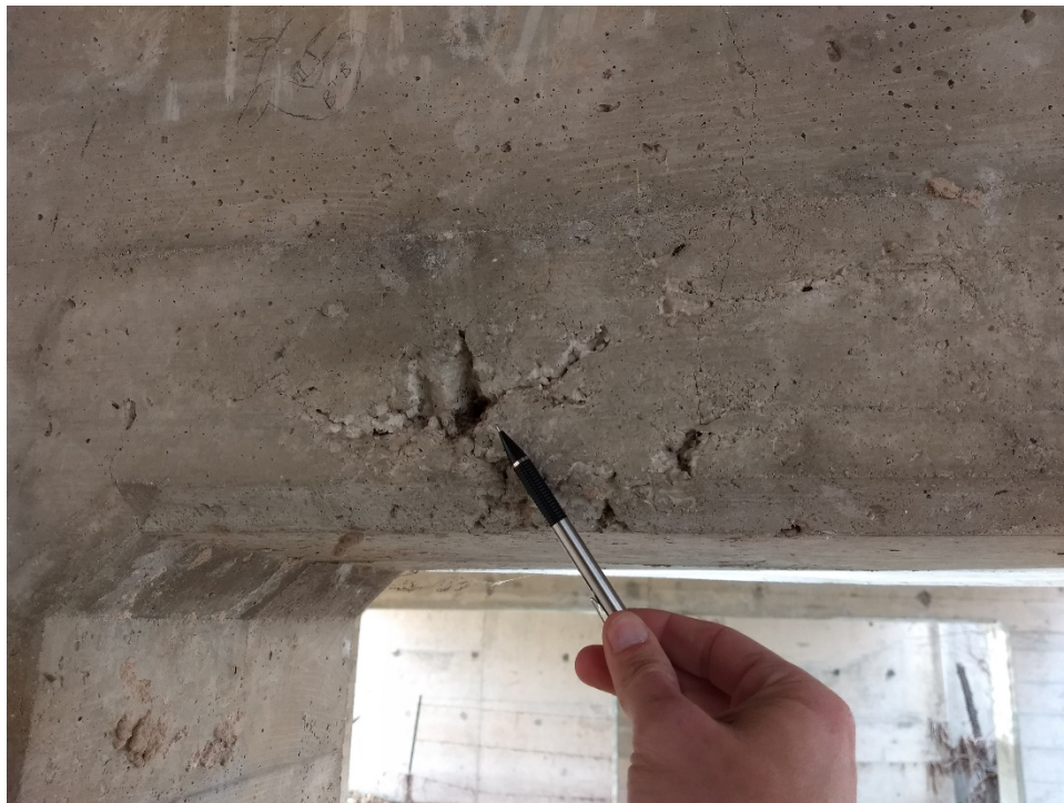
Hole in Beam