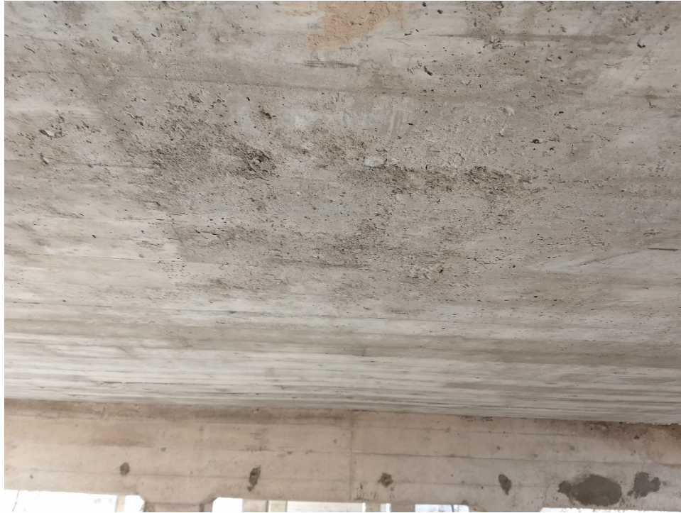
Bottom of slab water damage from drains