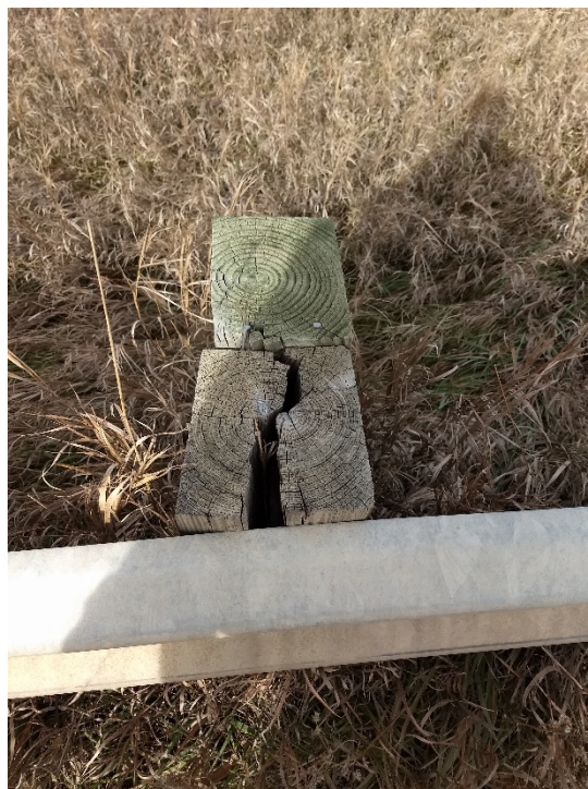
Cracks on guardrail