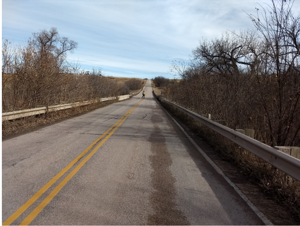
View of bridge looking west