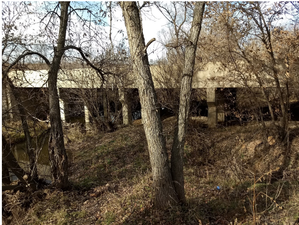
View South Through Bridge Looking Upstream