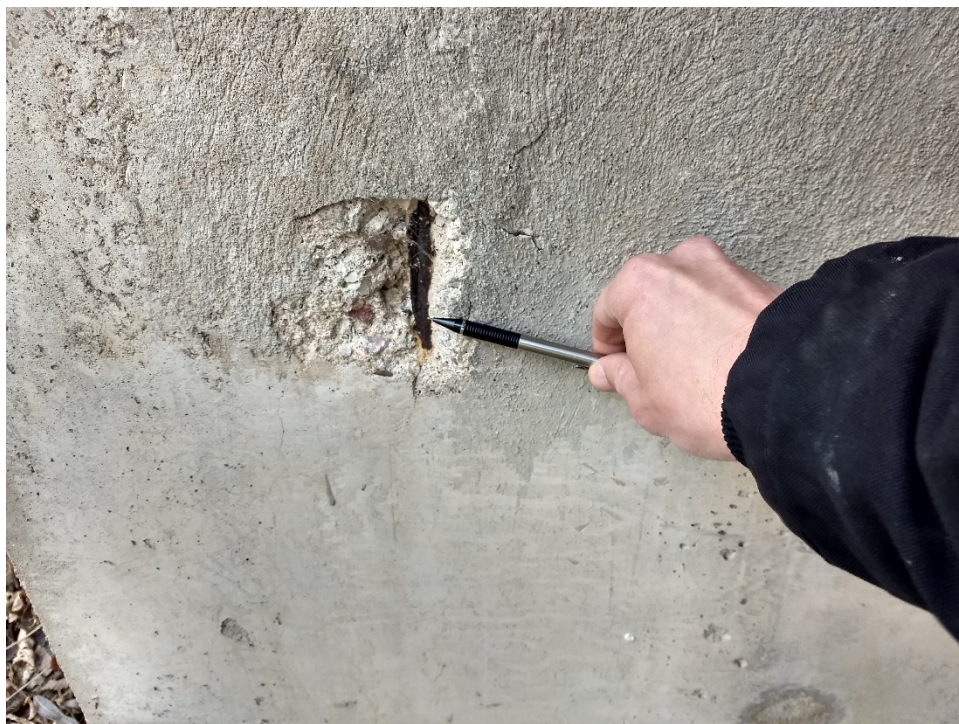
Exposed reinforcement on north end of east abutment